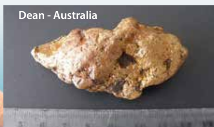
Dean - Australia