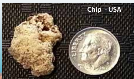
Chip - USA