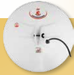
18-inch Monoloop (P/N 3011-0075)

Find more gold of all sizes and at all depths with a specialist Commander accessory coil.